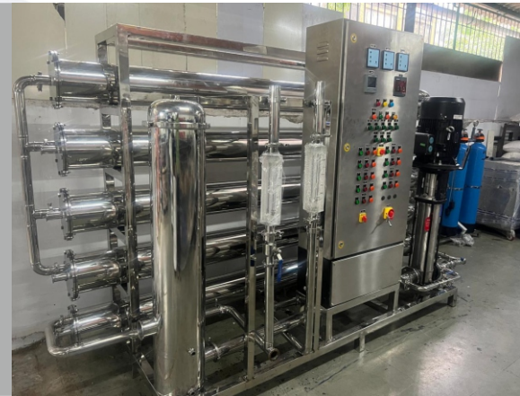
R O Plant