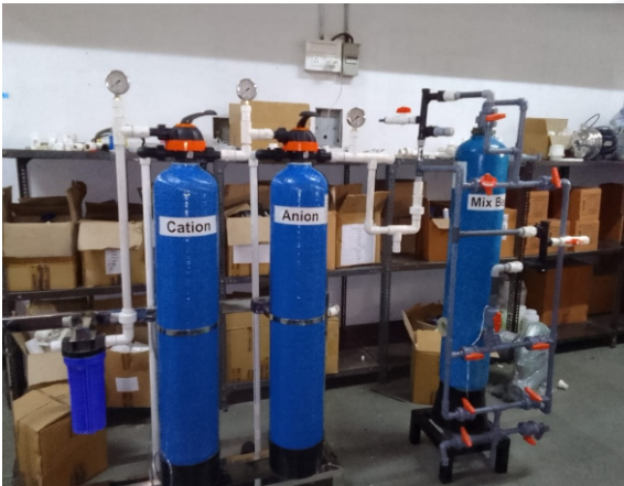
D M Plant

Waste Heat Boilers. Electrode Boilers. Dewaxing Autoclave Boilers. Incinerators.