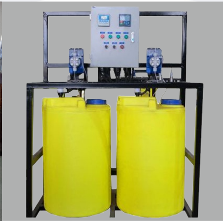
P H Dosing System